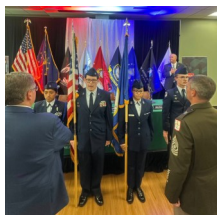
JHS' JROTC students at Ivy Tech's ETC Signing Ceremony