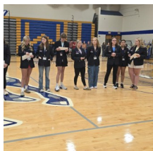
NWHS ambassadors lead the Academy Induction Ceremony