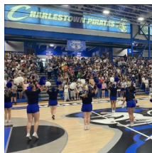
CHS showed self-pride at their annual Kick-off Pep Rally