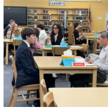
Mock interviews are conducted for all Freshman at CHS