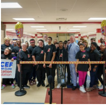
JHS Applied Careers & Poppin Flavors at the ribbon-cutting event