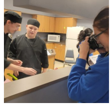
CHS Culinary & Radio/TV students collaborate at the Iron Chef event