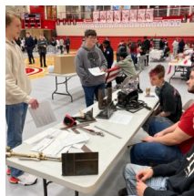
JHS freshmen learn about all programs at the academy showcase