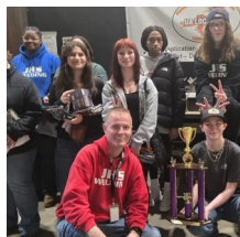
JHS women welders & their teacher show off a 3rd place trophy