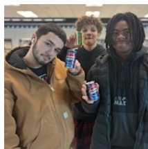
CHS Seniors on track for work ethic certificate; smile with their reward