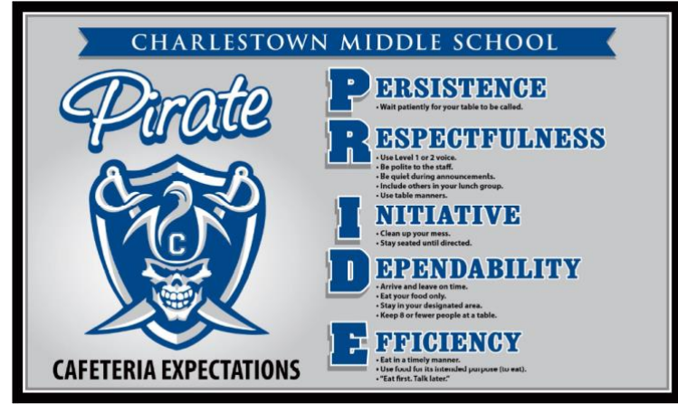
REMEMBER - EVERYONE IS RESPONSIBLE FOR CLEAN UP