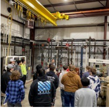
Local 502 talks about apprenticeships to JHS students in trades path