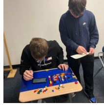
NWHS students design & build mazes for their Academy Novel's PBL