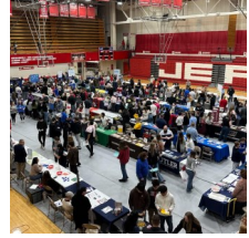
GCCS juniors discover postsecondary options at their college fair