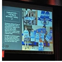
CHS' WPMQ wins the community service award at the IASB event