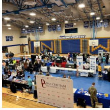
Employers packed NWHS' gym for their annual career fair