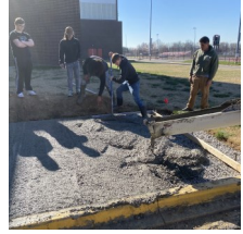
Construction students spread concrete to repair JHS' sidewalk