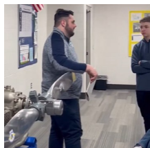
A JHS sophomore speaks with an aviation teacher at Prosser