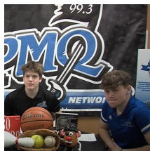
Sports broadcasting students at CHS banter during their new show