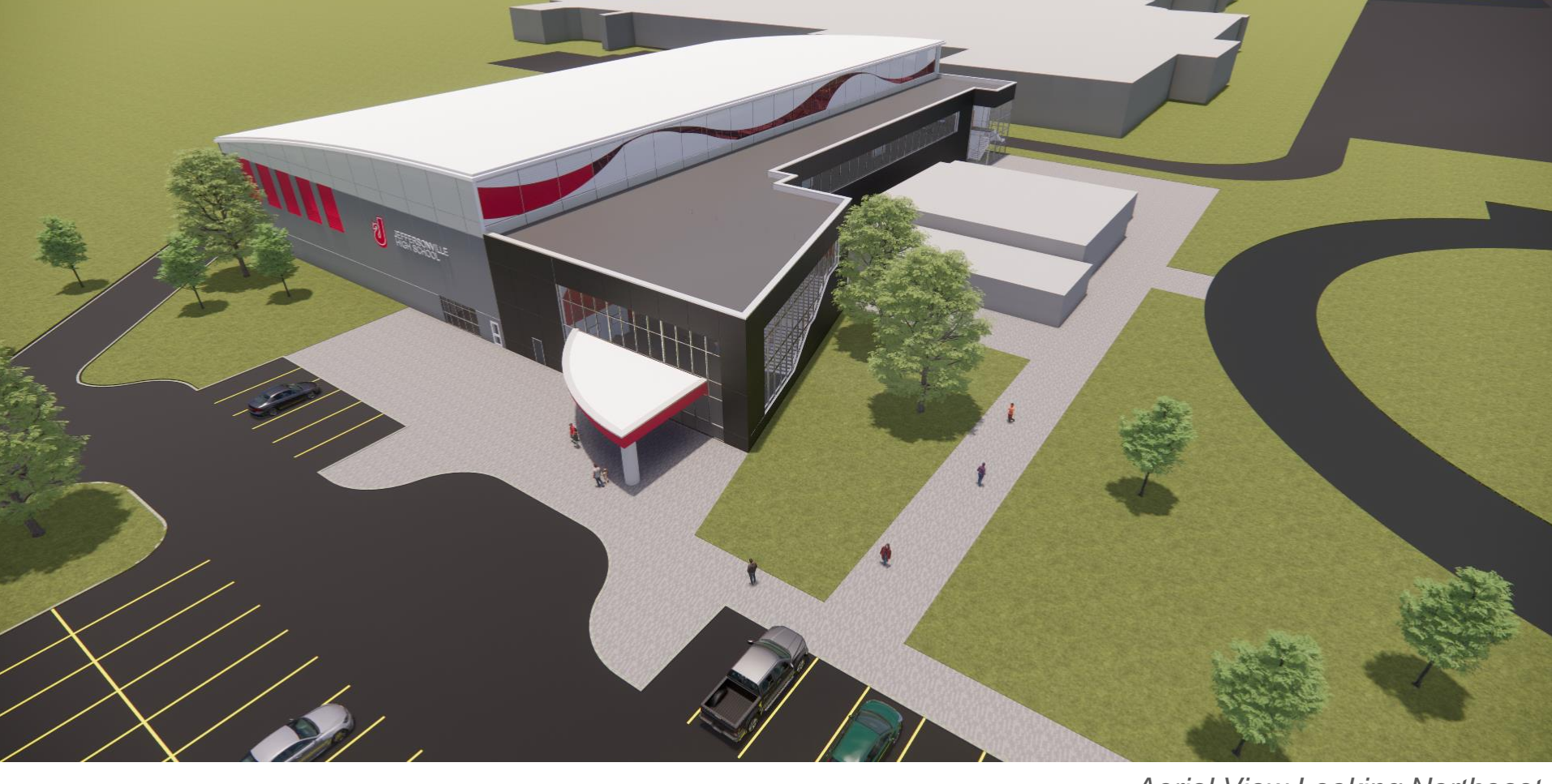
Aerial View Looking Northeast