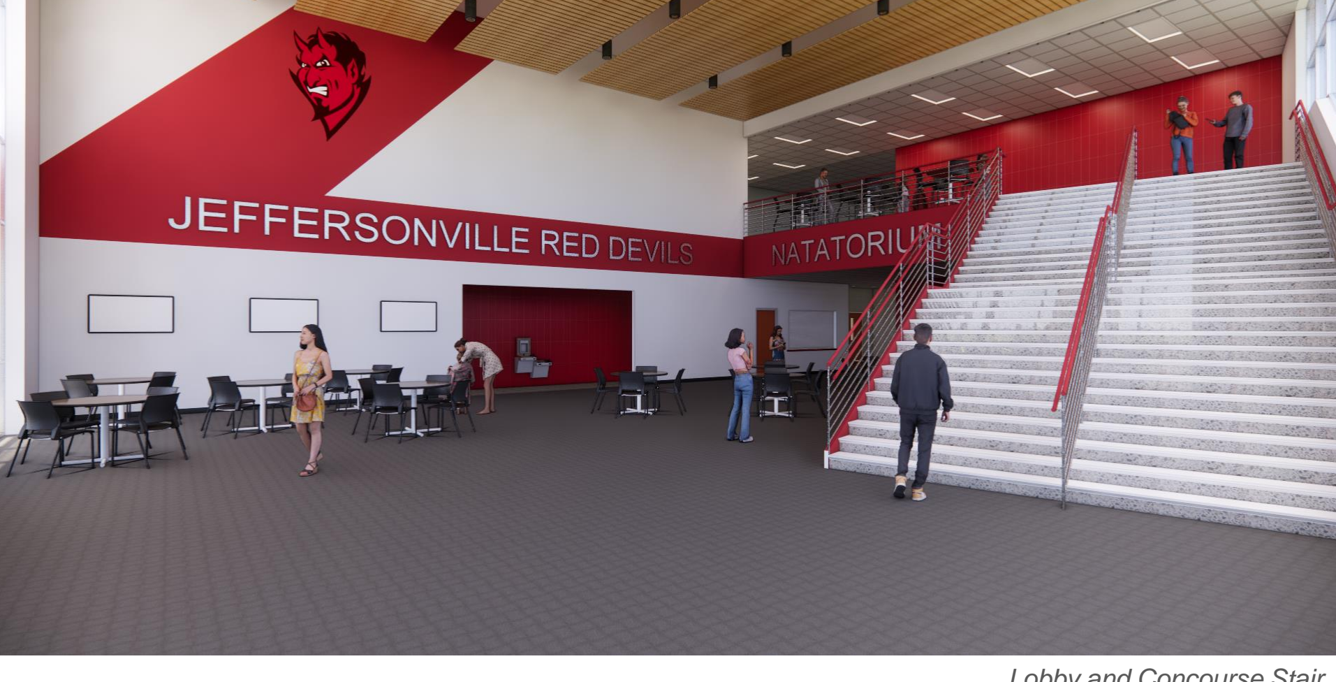
Lobby and Concourse Stair