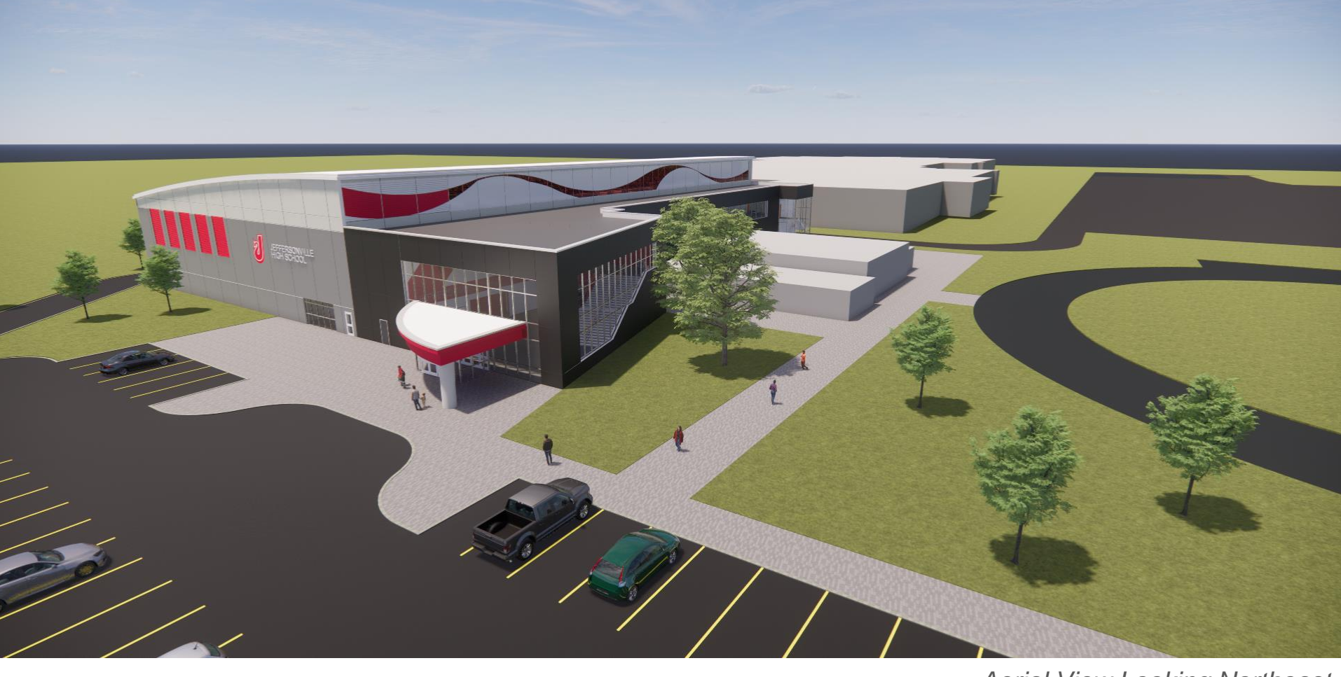
Aerial View Looking Northeast