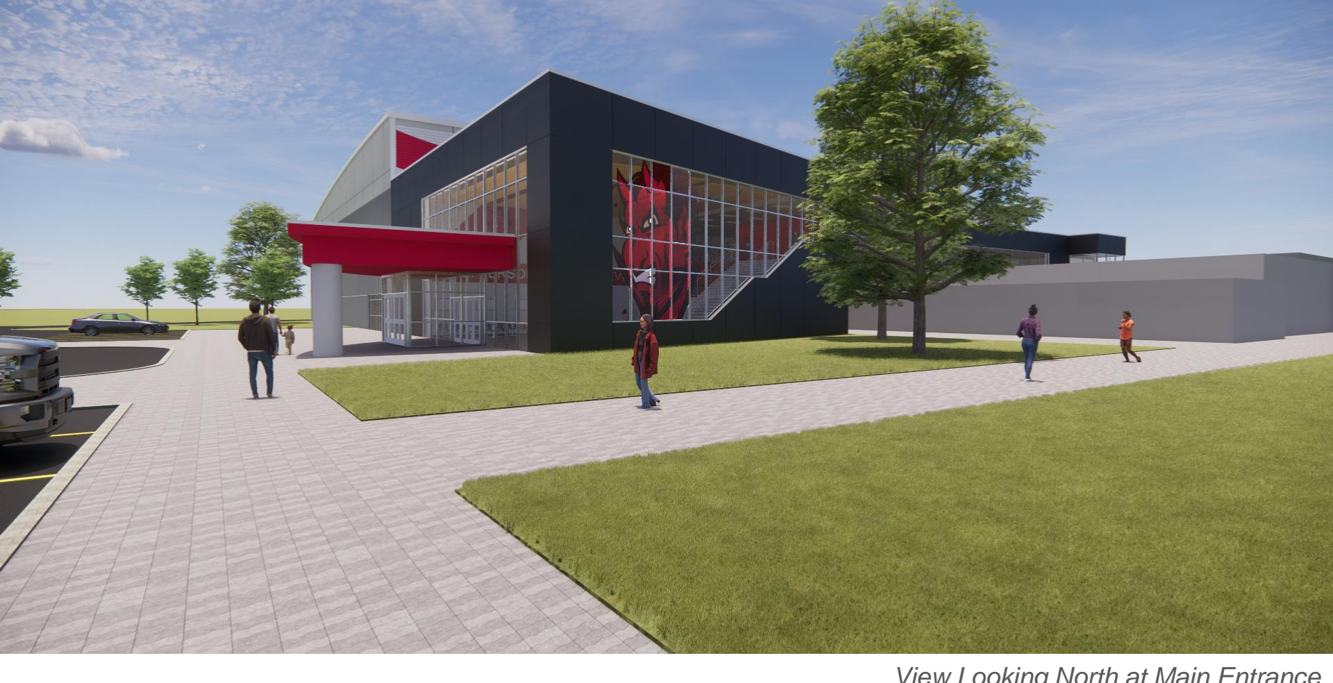
View Looking North at Main Entrance