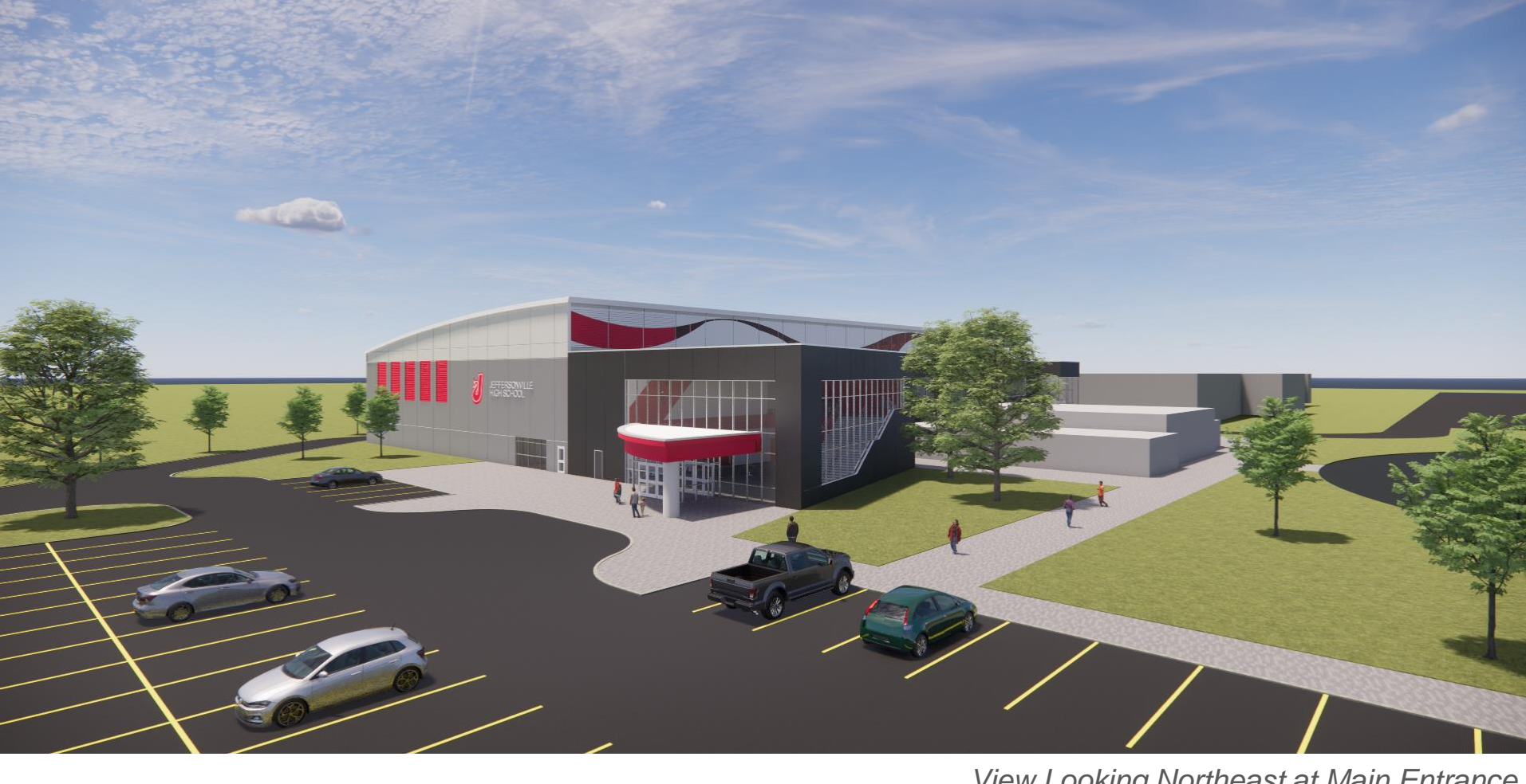
View Looking Northeast at Main Entrance