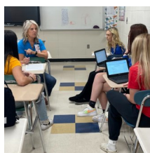
NWHS Health Academy students get resume feedback from an RN