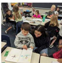
An Ed Professions student from CHS at a local elementary school