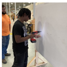
A student from JHS screws in drywall at the IKORCC training facility